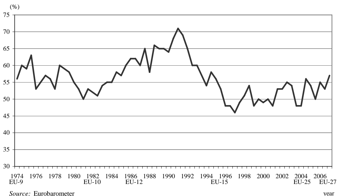
Figure 1. Participation in the EU: Percentage of public opinion in favour *

There is similarly no factual corroboration to feelings that public support for European institutions has continued to wane: as shown in Figure 1, over 50% of respondents to a Eurobarometer survey continue to view participation in the Union as ‘positive’; this percentage has risen again over the current decade, after having declined in the nineties. Opinion polls also show that among national and Community institutions, the European Parliament continues to enjoy considerable prestige, although declining voter participation in European elections might seem to point in the opposite direction (Hix, 1999).